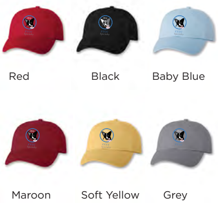
Red Black Baby Blue

100% Cotton, Bio-Washed Chino Twill, Unstructured, Low-profile, 6 panel, Pre-curved Visor, Sewn Eyelets, Cloth Strap, Tri-glide Buckle Closure.